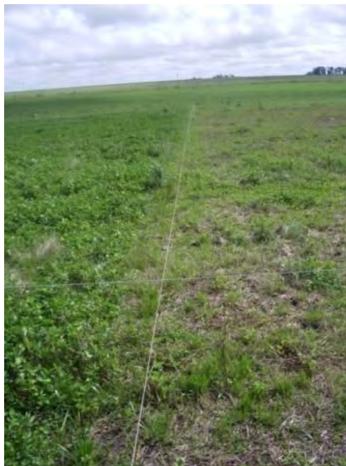
Photo 3: Intensive rotational grazing system in Uruguay. Paddocks on the left are about to be grazed, paddocks on the right have just been grazed. The system was under a rotation of a 2 day graze with a 50 day rest period.