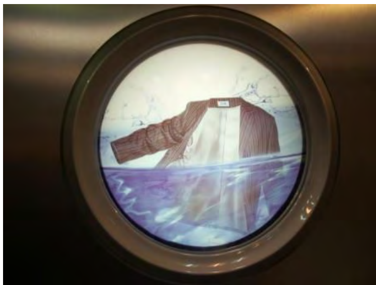
Photo 6: Advertisement in China for the Helian Group/AWI machine washable suit.

Helian Group employs over 10000 employees and produces 15 million meters of worsted fabrics. The Helian Group has 250 retail outlets in China in which they supply all textile fabrics. Recently, in collaboration with AWI they have developed a machine washable suit (Photo 6). The suit is a 50/50 blend of polyester and 20 micron wool. In the initial period they made 65000, of which 35000 had been sold when I was in China. The two main selling points of the suit are that it is machine washable and therefore better for the environment, with less chemical needed to wash the suits than with traditional dry cleaning. Secondly, with everyone leading a busy lifestyle machine washing is easy (J. Zhu 2007, pers. comm., 11 October).