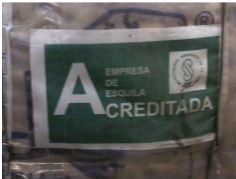
Photo 5: Wool classification system in Uruguay. Green labelled wool is well skirted with above average colour and staple strength.

In contrast, Australian wool in the majority of cases is sent overseas for processing. Thus the feed back is very disjointed. A possible way to improve this is to follow the Uruguay model and bring the processing industry back to Australia. This will not be possible in its current form due to the high costs of labour and the overall cost of manufacturing. Through new technology, we may be able to bring processing back to Australia. This is something the wool industry needs to work towards, a way of processing wool without the reliance of water. As technology becomes more advanced and scientists learn more about wool I am sure that this can be achieved.