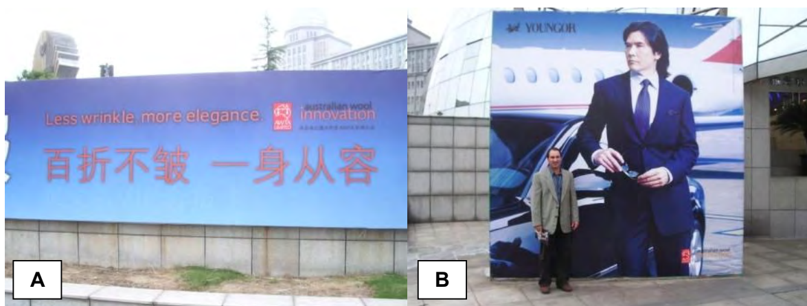
Photo 7: Ningbo Youngor/AWI travel suit A.) Promotional material in China advertising an easy care travel suit B.) Promotional material illustrating the design of the suit.

Ningbo Youngor Worsted Spinning Weaving & Dyeing Co., Ltd. is a joint-venture vertically integrated company established by the Youngor Group. The company finishes 155 tonnes of tops/year. Of this 80% of the tops produced are pure wool with 20% being wool rich blends. The average micron is 20.5 with the finest being 16.5, 75% of tops are exported. The company invests in the latest technologies which gives them a strong foundation for the production of a raw material to fabric. This results in 5 million meters of worsted wool fabric being produced each year which is mainly sold to the high end of the market. The Youngor Group in co-operation with AWI has developed a 100% Australian Merino wool travel suit, which is crease-resistant (Photo 7). Part of the advertisement of this suit shows a picture of Australia pasture so customers get a feel for the natural aspects of Australian Merino wool (J. Zhu 2007, pers. comm., 12 October).