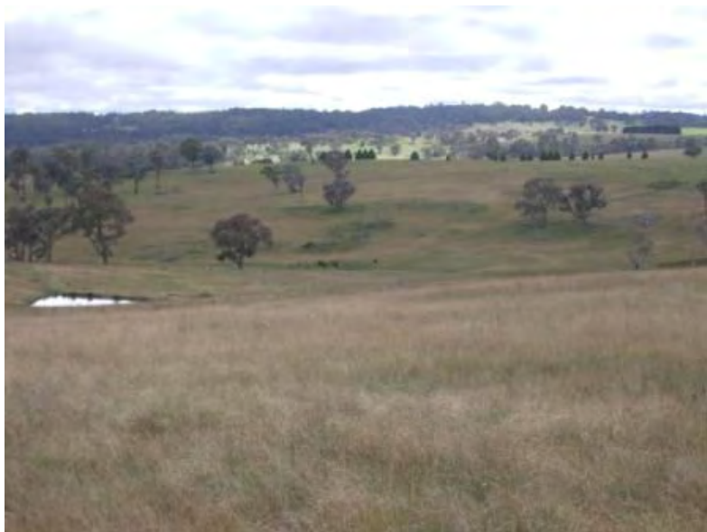
Photo 1: Naturalised pastures on the Northern Tablelands of New South Wales, Mt William.