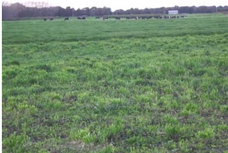
Photo 2: Intensive rotational grazing in New Zealand improves pasture quantity and quality.

Research in New Zealand (Photo 2) and Australia has shown that RG has the potential to increase pasture growth compared to conventional grazing systems by 30-50%. Kahn (2003-2005); Charlton, J. F. L., & Wier, J. H. (2001). RG, therefore, has the potential to lift stocking rates by at least 20%. In many cases it is higher than this. The reason for the increase in pasture under RG is that the system allows greater control over the management of grasses and increased pasture utilisation over the grazing area. This allows the pasture to be kept at a more even level and consequently a higher level of digestibility as the grasses remain in a vegetative state for longer. There is, therefore, plenty of leaf area for maximum photosynthesis and reduced older growth thus young foliage is not shaded out so it continues to grow. A higher percentage of green material leads to higher digestibility in the sward increasing productivity.